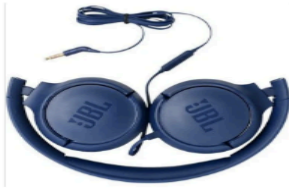
1 pair of headphones (NOT Bluetooth)