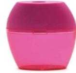
1 Pencil Sharpener