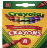
1 box of crayons