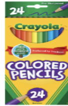
1 box of colored pencils