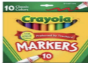
1 box of markers